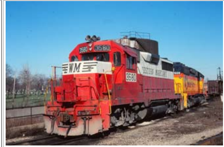
GP35 3580