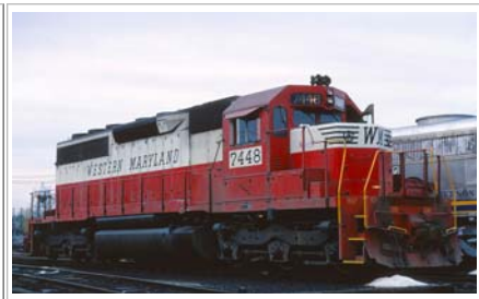
SD40 7448