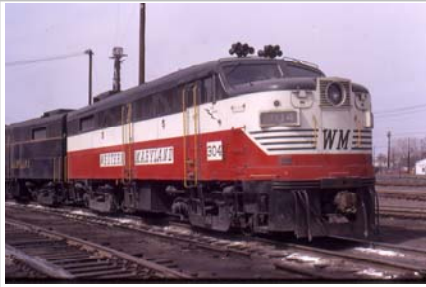
FA2 304