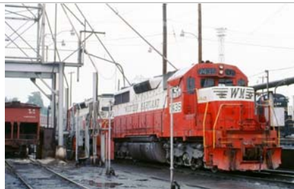
SD35 7435 Michael Woodruff photo