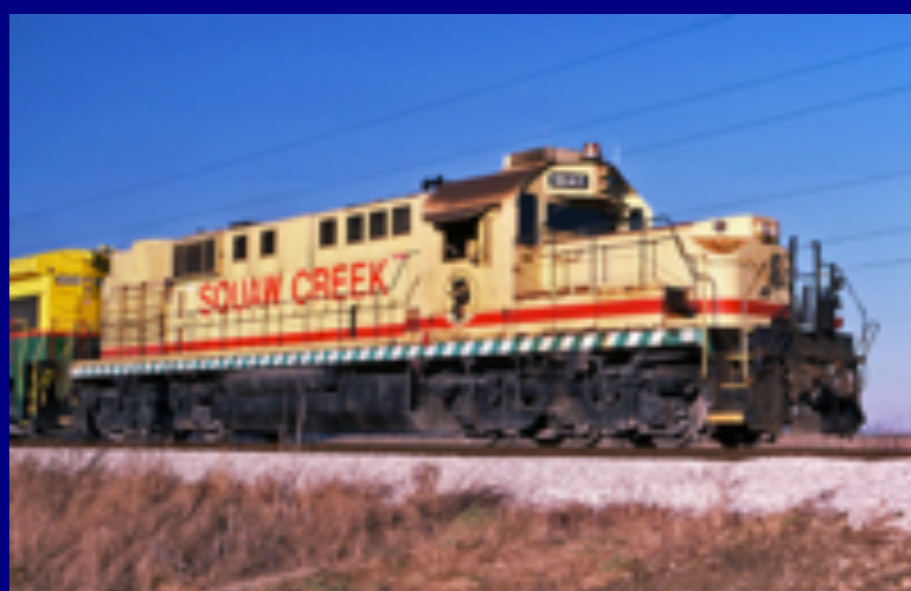
Squaw Creek 9842