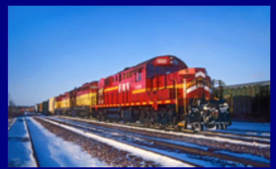
Fox River Valley 2406