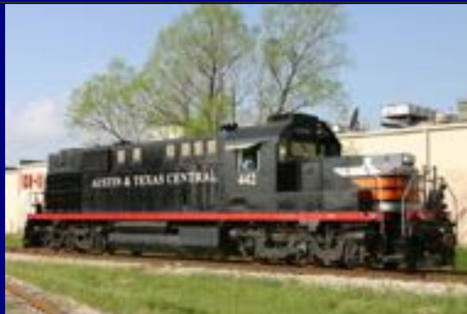
Austin & Texas Central 442