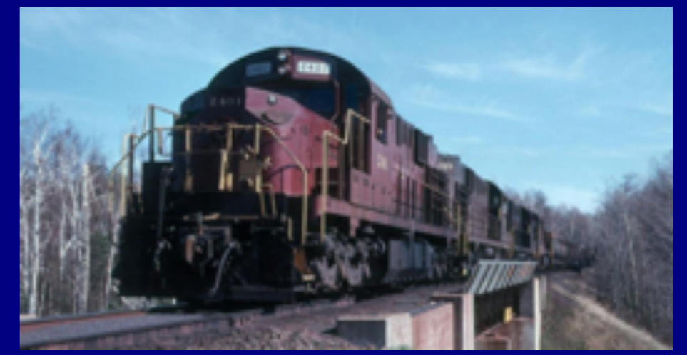
Lake Superior & Ishpeming 2401