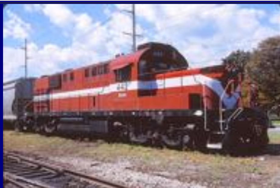
Wabash & Ohio 442