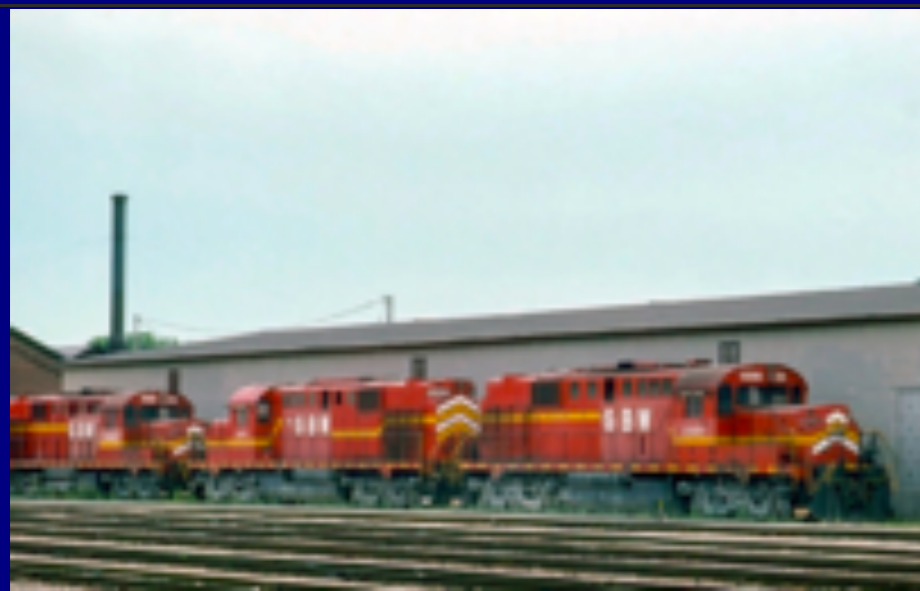
Green Bay & Western 2407