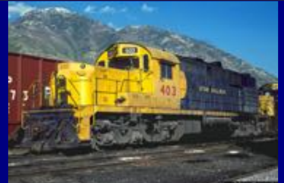
Utah Railway 403