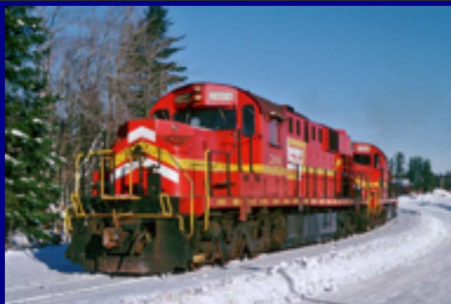
Lake Superior & Ishpeming 2404