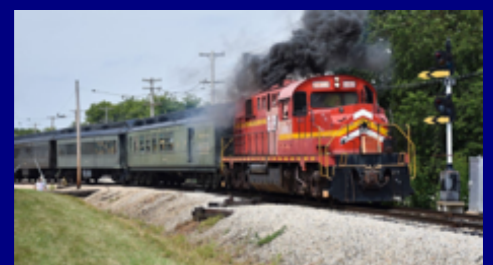
Illinois Railway Museum

Please help: Good photos are needed of the RSD15s at: • California State Railroad Museum (ATSF 9820) • Utah State Railway Museum (Utah Railway 400)