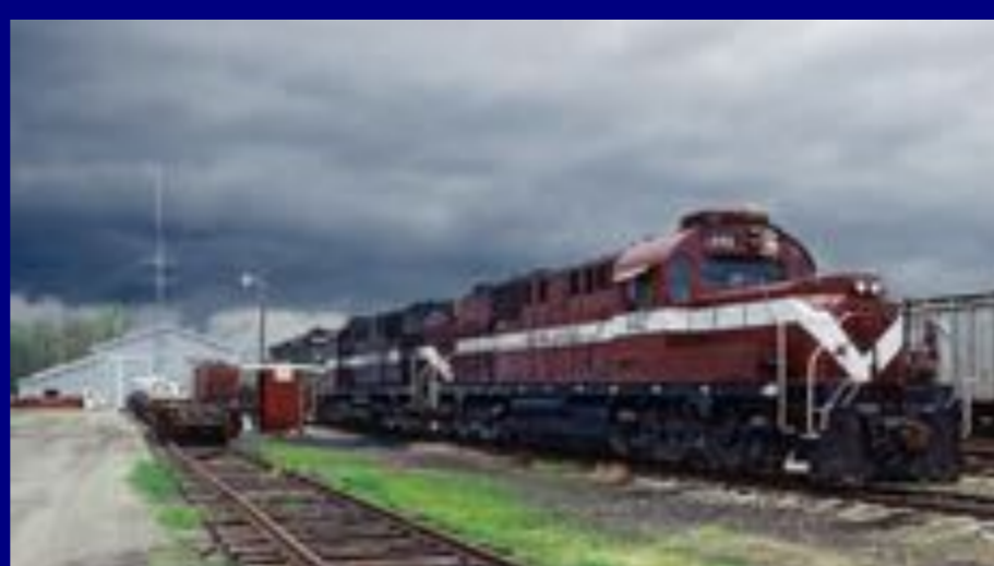
Indiana Hi-Rail 442