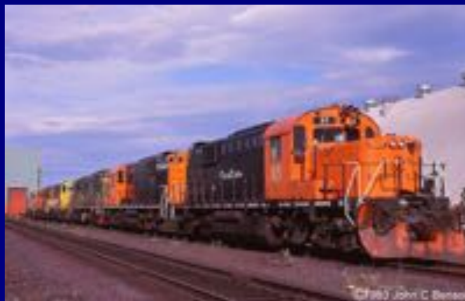
Cartier 95