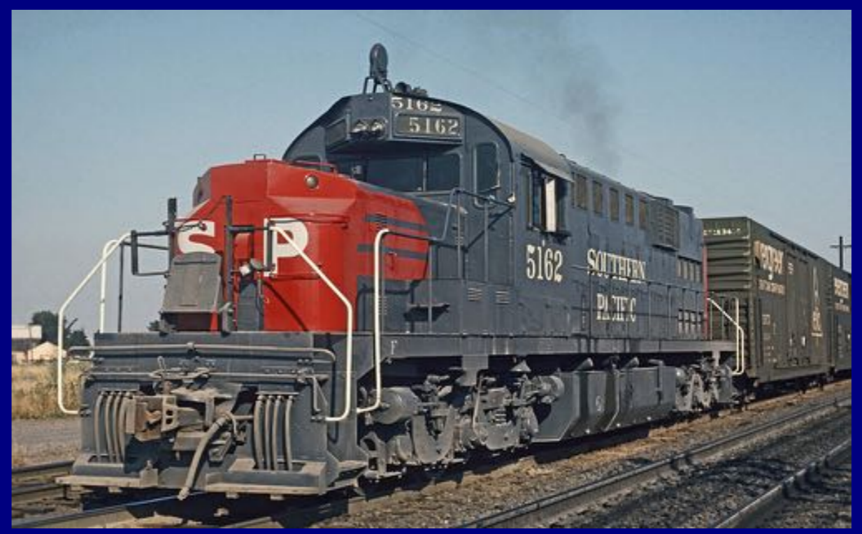
Steve Schmollinger photo at Eugene, OR

A survey of Alco fans would probably show that the six-axle RSD15/17 "alligator" was one of their all-time favorite diesels. The Schenectady, NY manufacturer built sixty-three of the elongated low-nose models between January 1959 and March 1960. (It also built 12 high-nose versions of the 2400-hp locomotive.) ATSF was the largest alligator buyer with 50 units (#800-849), SSW bought 10 (#850-859), and SP purchased 3 (#4816-4818). The ranks of the so-called alligators grew slightly when Quebec Cartier Mining chopped the nose of six ex-B&LE high-nose RSD15s #881-886 (nee DM&IR #50-55). The only other example was Canadian Pacific RSD17 #8921. The one-of-a-kind model was built in 1957 by Montreal Locomotive Works, (an Alco subsidiary). Comparable to its 2400-hp Alco-built cousins, it received the low-nose treatment from CPR shop forces in 1988.