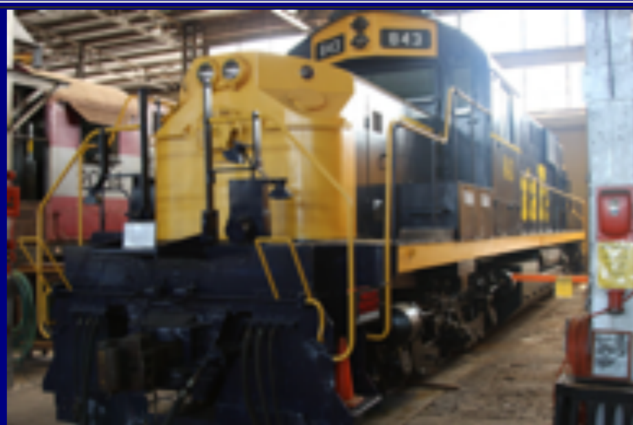
Arkansas Railway Museum Andy Tucker photo