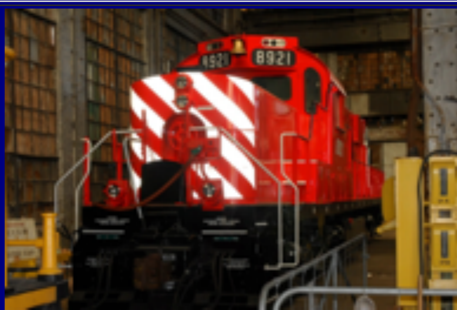
Elgin County Railway Museum Dave Broughton photo